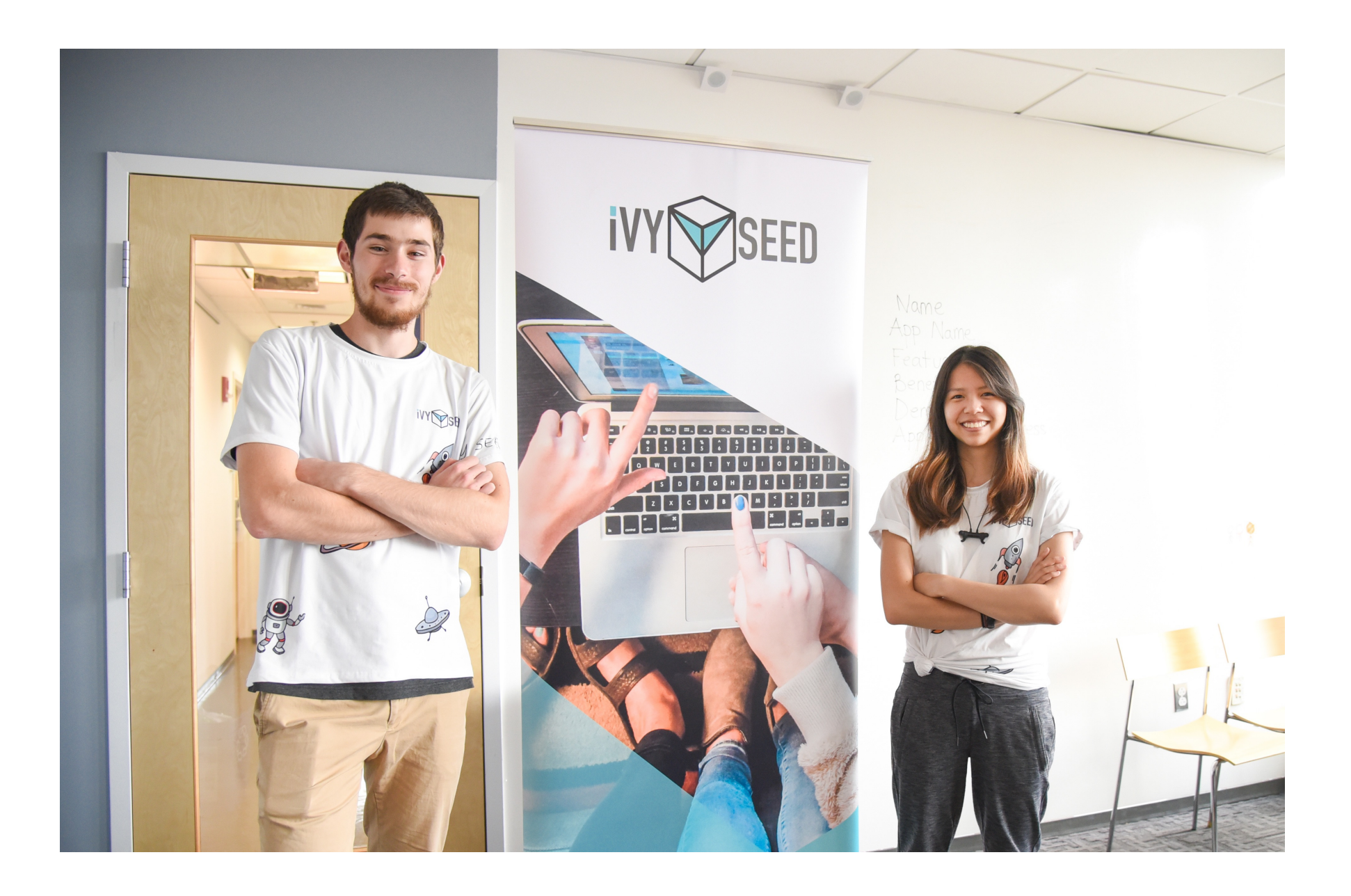
2023 Ivy Seed Summer Camp